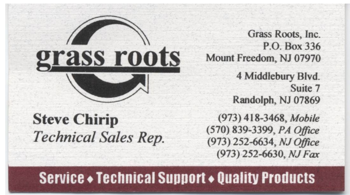
Photo of the Month