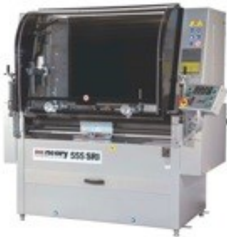
Model 555 SRI Spin & Relief Reel Grinder

With the flexibility and speed to meet all of your reel maintenance needs.