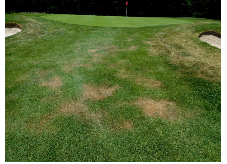
Turf on green, collar and surround damaged by being mowed when wilting. Similar mower damage can occur during wet wilt events in summer, June 2016.