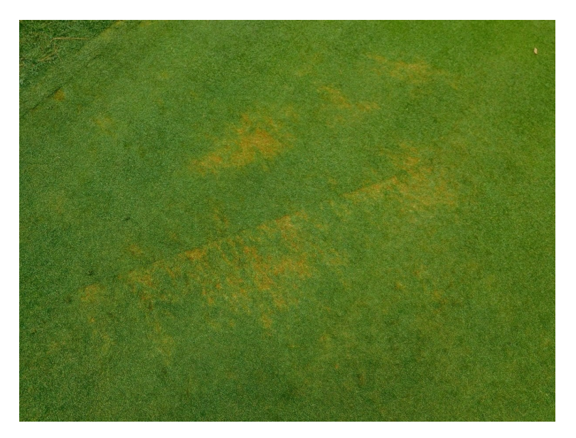
Prolonged wet weather caused this green to become puffy and was scalped, May 2016.

There were about 20 days of overcast, cool and rainy weather in May. The persistent wet and overcast weather made it nearly impossible to keep up with mowing. Some greens became puffy and were scalped. Sunny days arrived in early June, but the weekend of June 11 and 12 brought a blast of summer weather that shocked turf. On the aforementioned weekend, temperatures reached 90°F, winds were constant and in excess of 25 mph, and relative humidity was less than 45%. The rapid drying led to damage from drought stress or from mowing wilting turf. It also brought on localized dry spots.