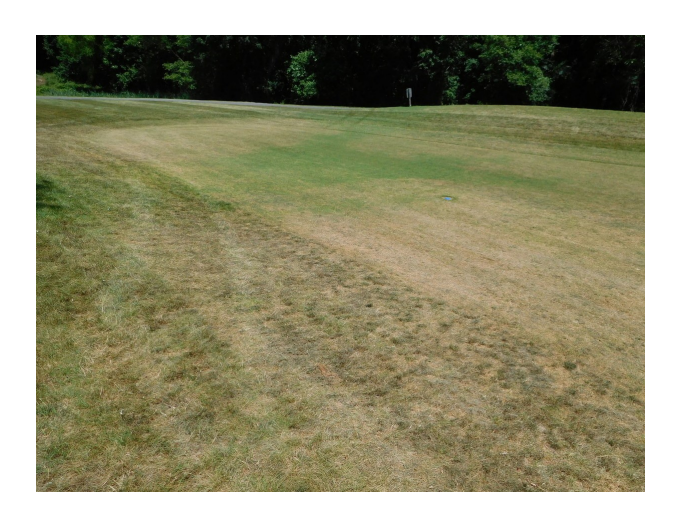
Hot windy weather caused drought dormancy over a weekend, even in common Bermuda grass, June 2016.