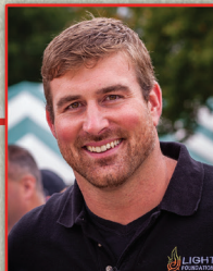
Featured Speaker Matt Light Former New England Patriot

Pesticide Applicators Recertification Credits offered