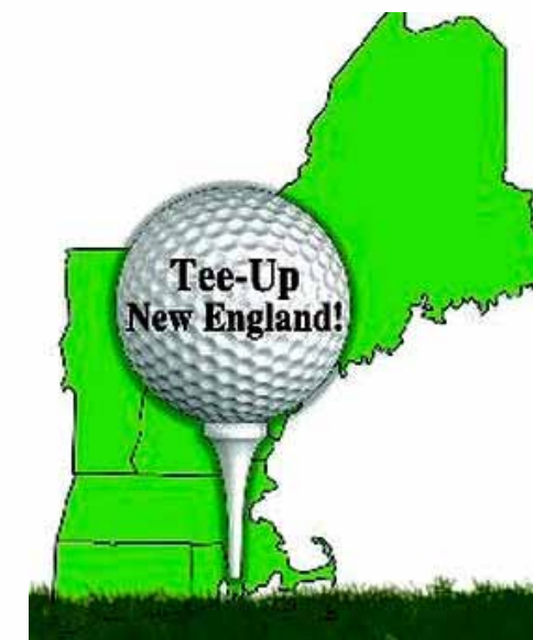
Better Golf Through Turf Research 2018 Auction held April 9-16, 2018 www.nertf.org