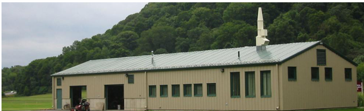
The Joseph Troll Research Center