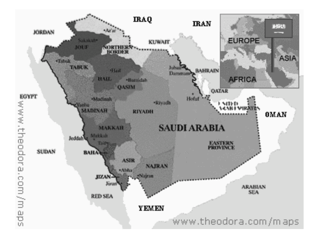
Figure 1: Map of Saudi Arabia's 14 Administrative Provinces; the location of Saudi Arabia is on the top right.

Islam is virtually the only religion practiced by Saudi citizens, and various Islamic sects can be found throughout the country, though the Saudi regime recognizes Wahhabism as the official doctrine of the country. This sect represents the school of Sunni Muslims who adopted Mohamed Bin Abdul-Wahhab's interpretation of Islam. In brief, Wahhabism is a fundamental Muslim movement that began in the mid 18th century in Najd, the central region of the Arabian Peninsula, and was associated with the Saudi royal family and their adherents from the local tribes. The movement was used to "Islamize" Arabia by returning to what Wahhabis claim to be the only pristine version of Islam and it attempted to challenge, often using physical force, any "heretical" alternate versions (Benoist-Mechin, 1957; Lacey, 1981).