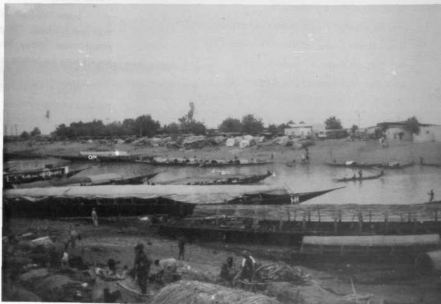
En route Djenne: 'the Niger is both the literal and figurative reference for West Africa, through it the arts of the subregion become the most travelled commodity'

It did not take too long after a first encounter with this Nigerian artiste about a decade ago, to whiff the presence of a visionary, cultural Pan-Africanist, even if a little unorthodox in his ways.