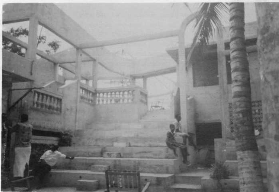
The Ki Yi M'Bock village, Abidjan mini-theatre under construction

West Africa remains a celluloid power in the continent partly due to its numerous national film festivals, but above all it