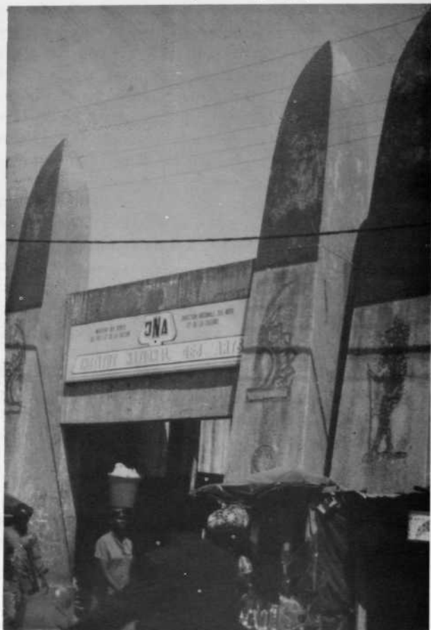
National Institute of Arts, Bamako, Mali

Above all however, generating a popular tradition will