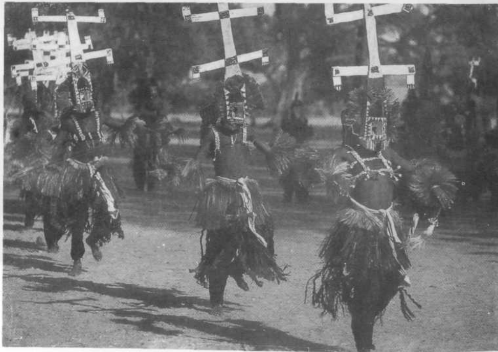
A Dogon Kanaga dance mask

Properly articulated, the new era is indeed capable of integrating the cultural sensibilities of the peoples of the Niger