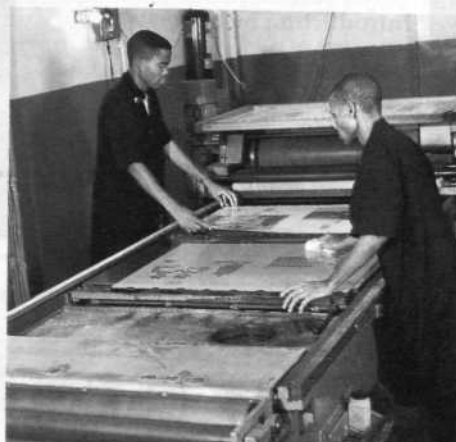
Full Machine Proofs/Progressives to A1 Size.