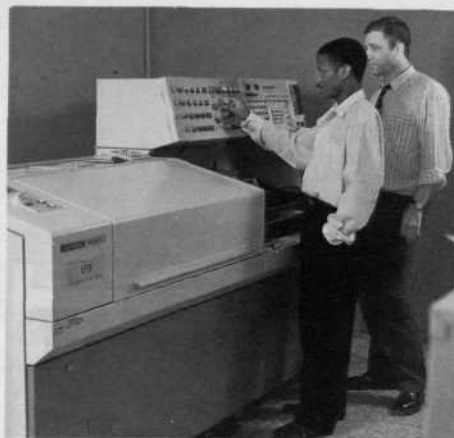
Our state-of-the-Art Laser Scanner/Vignette Generator to A2 Size.