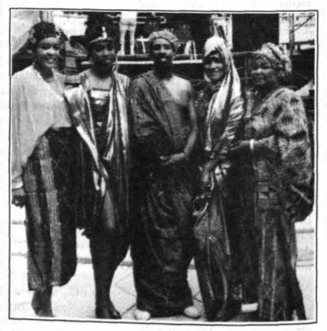
short of speaking Some participants at the last African World Festival in Detroit.