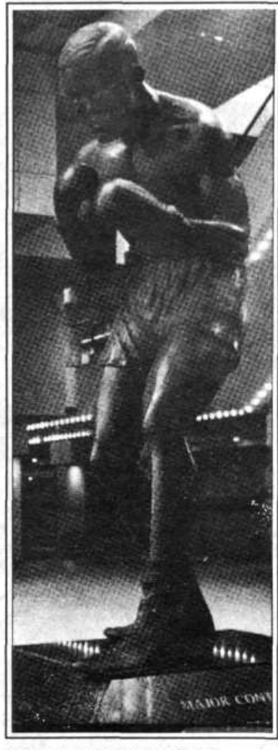
This boxer welcomes you to Detroit

But does the rich heritage mean so much to the average American Black? Many still live below the poverty level while the money made in the city is used to develop the suburb where the whites live. Ask yourself what the sublime aspiration of a society is and you would remain a philosopher! GR