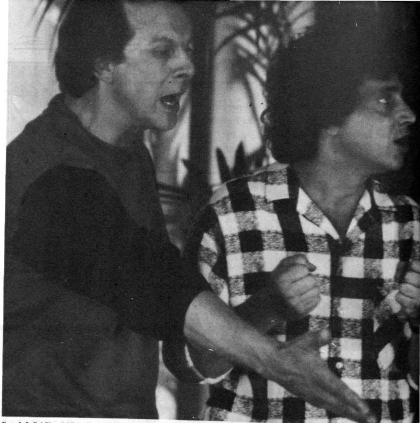
From Left: Rol Giraud, Michel Boujenah and Andre Dussolier in the French entry for the film festival Three Men and a Baby .