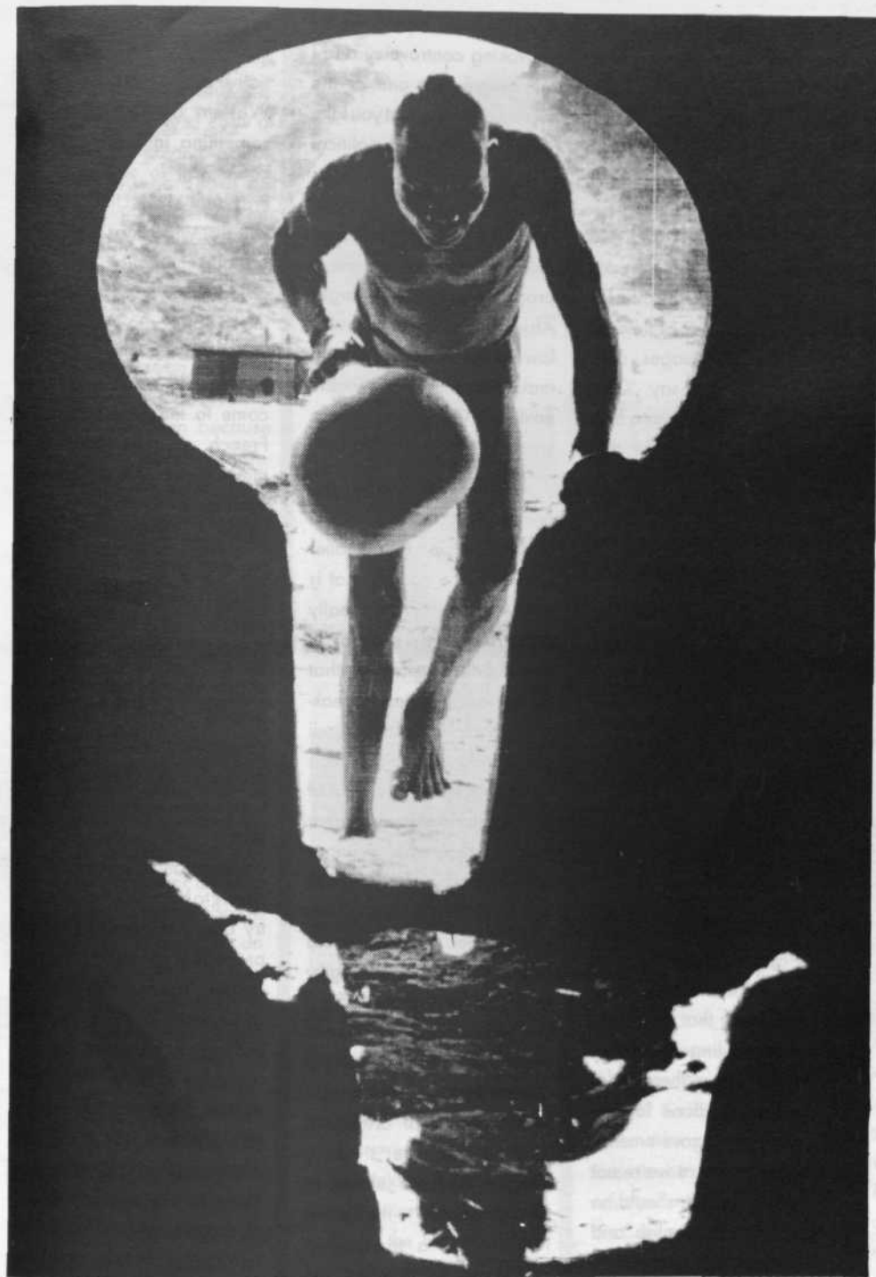
'A shape of Things to Come' George Rodger, Kordofan, Southern Sudan

forward. And in some respects I'm a bit of a linguistic determinant (in that) I think there are areas of performance which will elude us if we don't pay some attention to the problem of indigenous