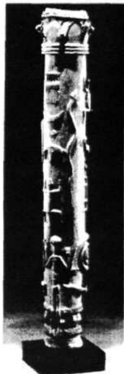
DRUM: Ivory Coast, Baule

168, Awolowo Road, Ikoyi, Lagos, Nigeria TEL: LAGOS 686870, 680089