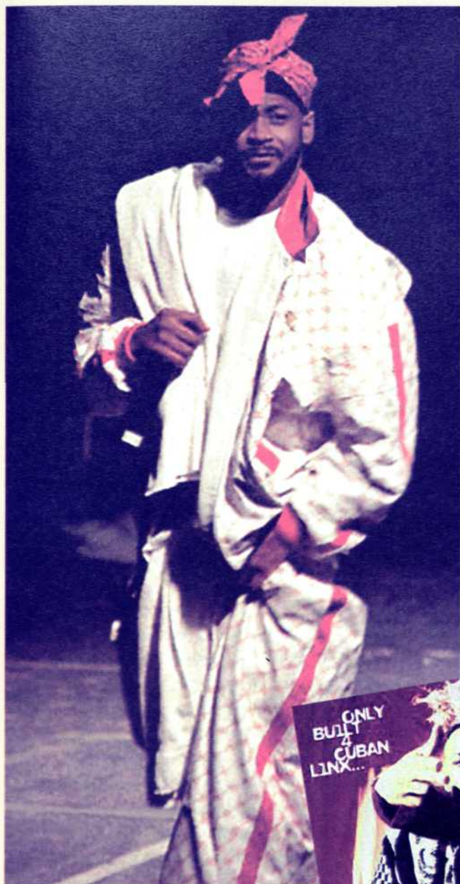
Wu-Tang Clan member