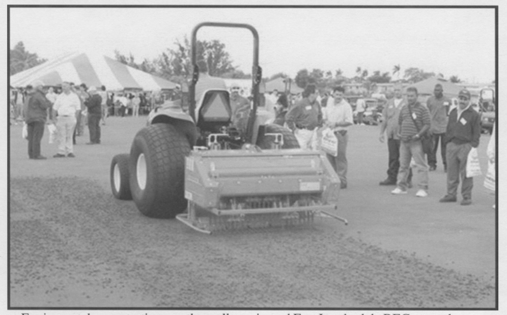
Equipment demonstrations on the well manicured Fort Lauderdale REC grounds are always a big hit with the superintendent attendees.

Registration forms for the Poa are available from the Everglades chapter and the FGCSA office. Room reservations can be made directly through the Naples Beach Hotel at 239-261-2222. Don't delay...these rooms will up quickly!