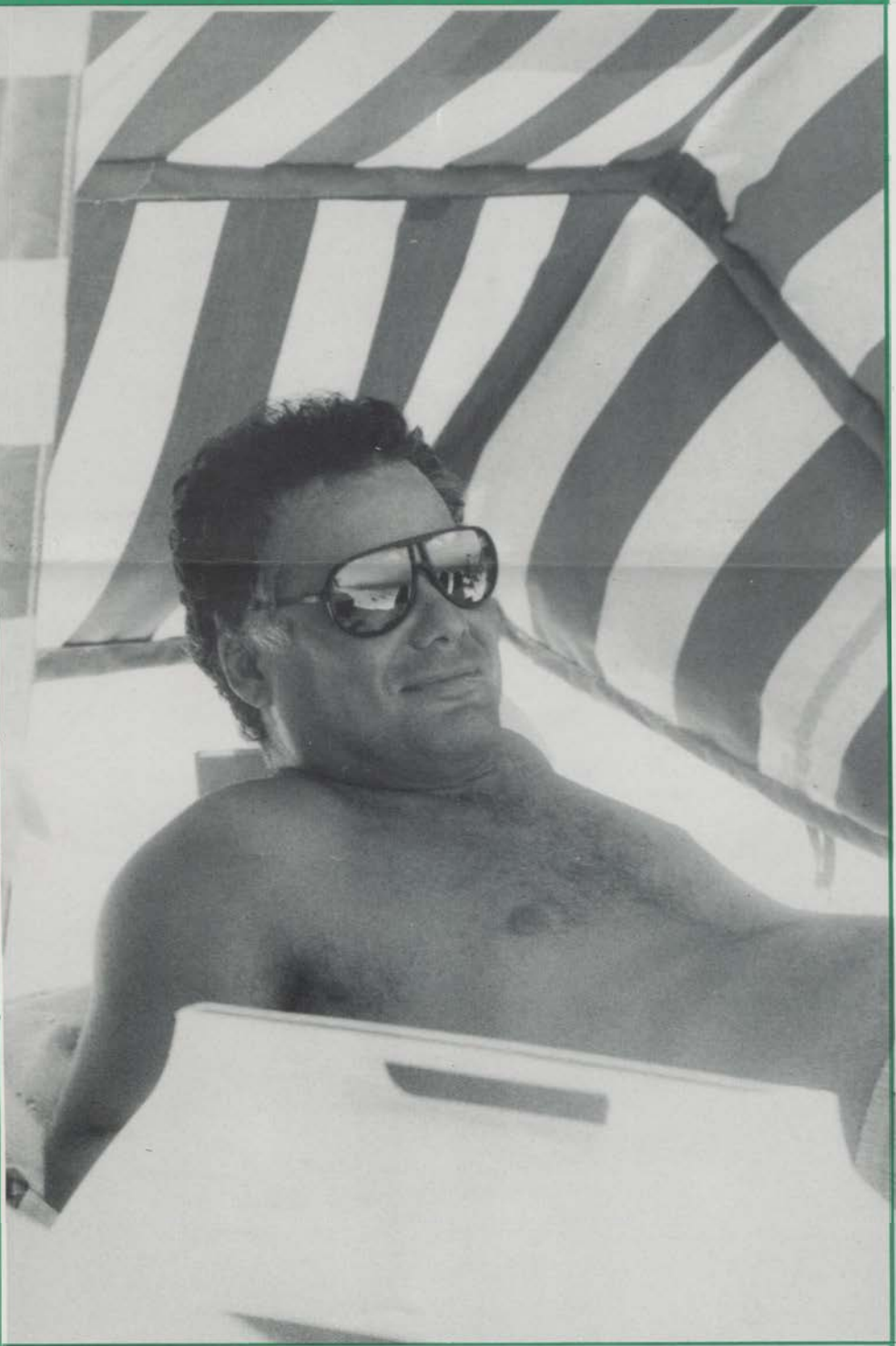
"The Clearing before the Storm"

The next FGCSA Board Meeting will be held on Saturday, August 4, 1990 at 1:00 p.m. in the Grand Cypress Conference Center. The Annual Meeting and Election of Officers of the FGCSA will be held at the conclusion of this meeting--approximately 4:00 p.m.. All interested FGCSA members are cordially invited to attend and become an active member of your association!