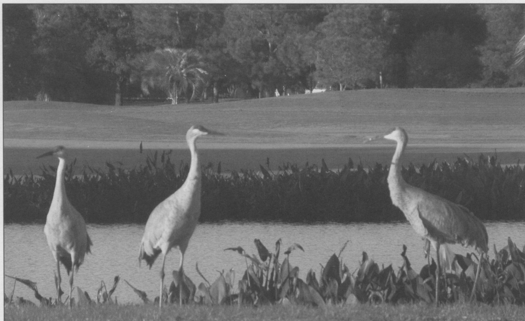
Sand Hill Cranes at Plantation GC in Crystal River

All golf course superintendents are invited to visit the Audubon International booth #S7609 on the Convention Showroom floor in San Diego. Superintendents are invited to attend their presentation on Wednesday (2/11/04 from 5-6 p.m.) on the "Business Value of Environmental Stewardship: An Environmental MBA for Superintendents".