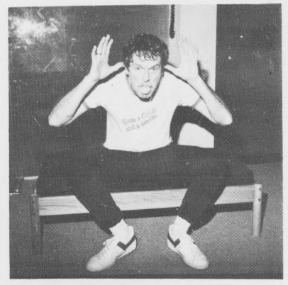
Here's a fine, upstanding pillar of strength in the community.