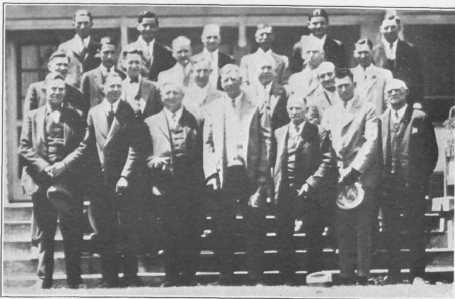
A meeting of the Indiana Greenkeepers' Association

Our association was organized in 1928 with 22 charter members. Its membership is now 35. Greenkeepers and assistant greenkeepers on Indiana courses are eligible for membership provided they have had at least two years of actual experience. The annual dues are $5. Meetings are held monthly at the various clubs with which the members are associated. Inspection of the course is made at the meeting, followed by a luncheon and a general discussion. The green committee of the club at which the meeting is held is always in attendance. At our meeting in October, 1930, which was held at the Christiana Country Club, at Elkhart, we held our annual tournament. The winter meetings are held at Hotel Lincoln, in Indianapolis. During 1930 twelve regular meetings were held.