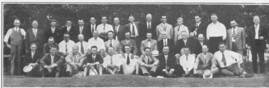
Philadelphia Association of Golf Course Superintendents