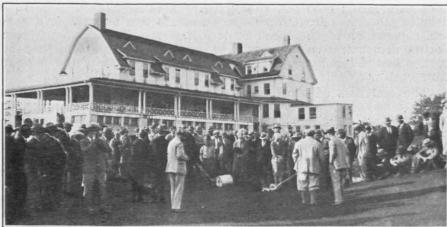
Hardly anything can compare in interest with a meeting on a golf course, where greenkeepers and committee members may get first-hand information on turf practices and the use of equipment. Green Section and Supply Section of Metropolitan Golf Association.

The beginning of the Metropolitan Golf Association Green Section dates back to June 23, 1925, when a special meeting of the Metropolitan Golf Association was called to consider and vote on a plan for the organization of a service bureau for golf clubs in the Metropolitan district. This meeting was attended by nearly 100 delegates, and after a discussion these delegates endorsed the idea of a service bureau and referred the matter to the executive committee with power to act. The purpose of the service bureau, as stated at that time, was primarily to help in the purchase of implements and materials and to distribute information and advice with regard to the maintenance of golf courses. The expense of this service was to be borne by a fee of $100 to be paid by each particular club. Twenty-two clubs applied for membership, and a headquarters was established at 2 Rector Street, New York City.