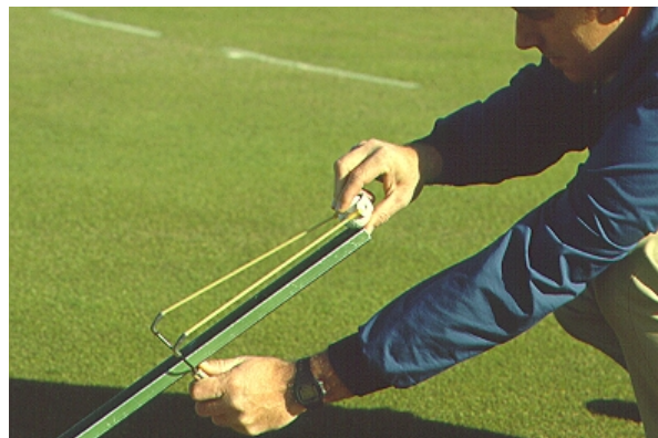
A reliable way to achieve faster green speeds

In last week's Record we ran a short survey asking golfers and golf course superintendents how they felt about green speed. Historically, the two groups were often at odds - golfers wanting faster surfaces (which usually meant lowering the cutting height) and superintendents trying to keep the greens healthy (which meant raising cutting heights). A lot has changed over the years, making it possible to at least come closer to keeping everyone happy. Check out the survey results for yourself.