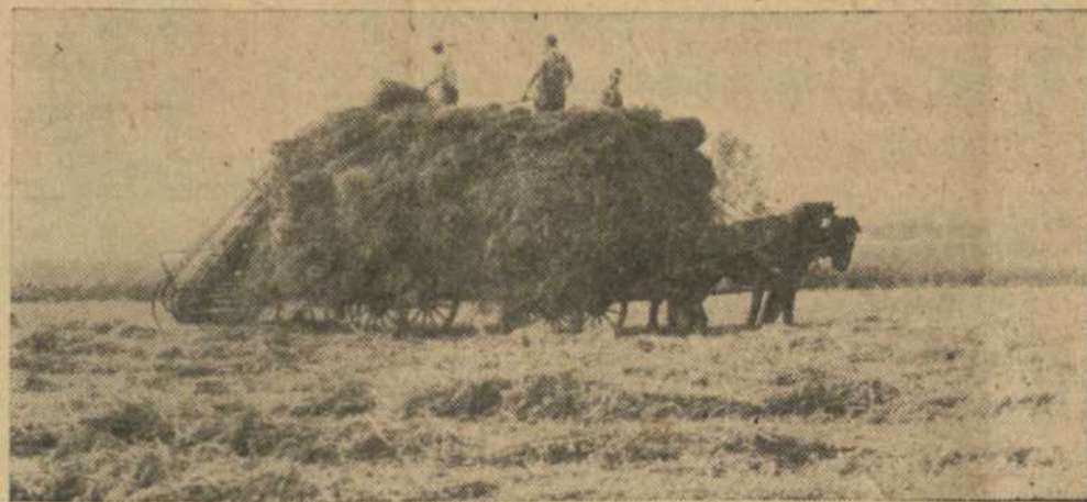
Farm Bureau Seed for Enduring, Heavy Yielding Stands

One Pound of Farm Bureau Alfalfa or Red Clover contains enough seeds (225,000 to 274,000) to place at least 5 seeds per square foot on 1 acre.