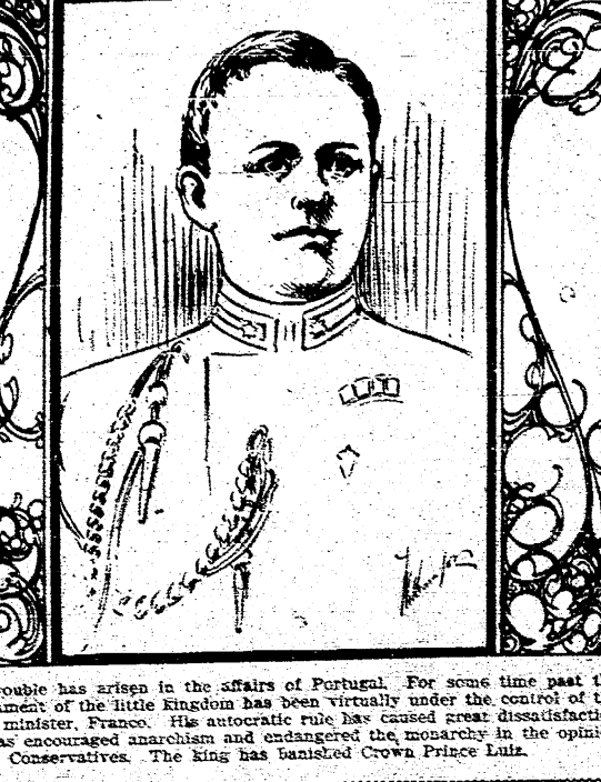
Portrait of the Crown Prince of Portugal, banished from his country.