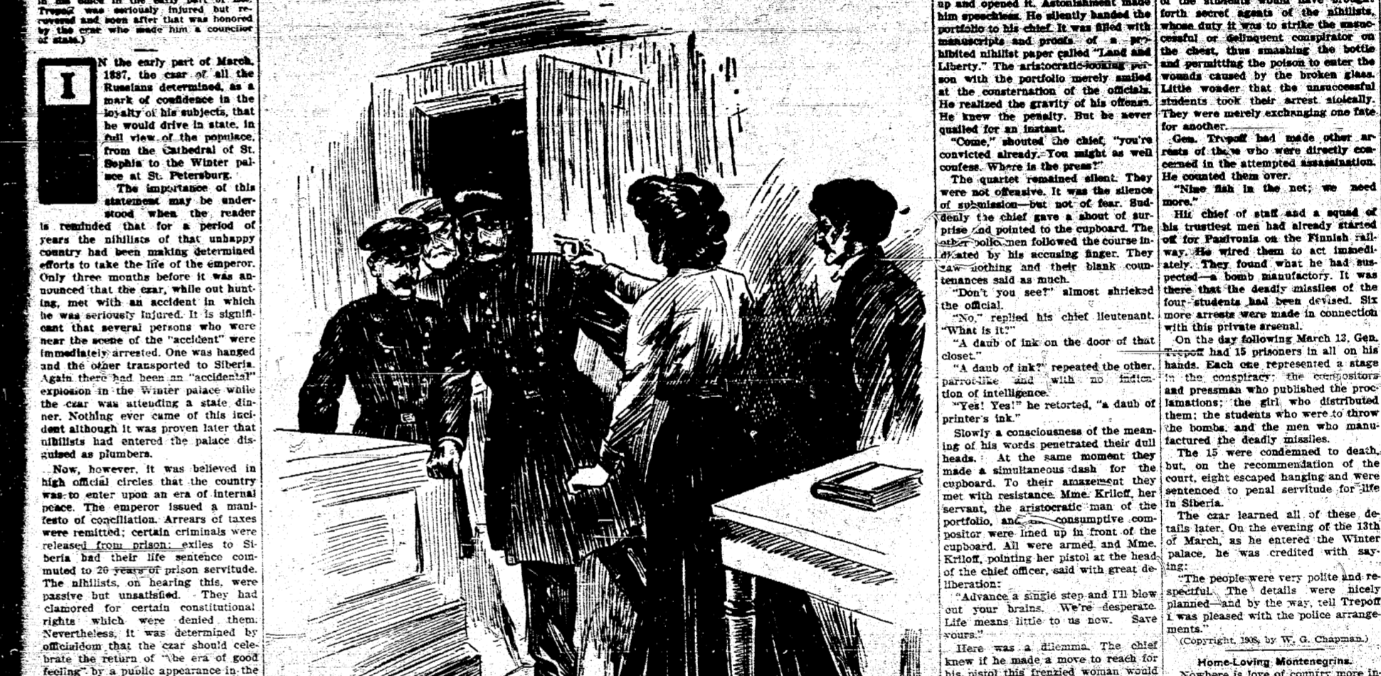
ADVANCE A SINGLE STEP AND YOU'LL BE BLOWN UP YOUR BEATHS!

The following interesting bit of information appeared in a Montreal paper: "Last December, in reviewing the year 1917, we had to record a wheat harvest which was the largest since 1914. The following interesting bit of information appeared in a Montreal paper: "Last December, in reviewing the year 1917, we had to record a wheat harvest which was the largest since 1914."