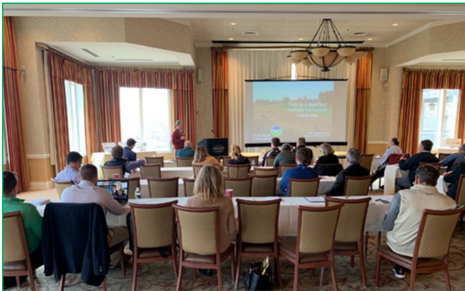
Attendees at the 2021 Annual Meeting and Conference of the New England Golf Course Owners Association.

I attended the Annual Meeting and Conference of the New England Golf Course Owners Association (NEGCOA) held at the Lake of Isles Golf Course in North Stonington, Connecticut, early December. It was an interesting meeting with a lot of open discussion about the state of the industry. Many items we have in common with this group such as labor issues, supply issues, outside event