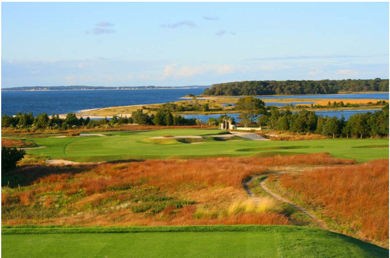
National Golf Links of America 17th hole