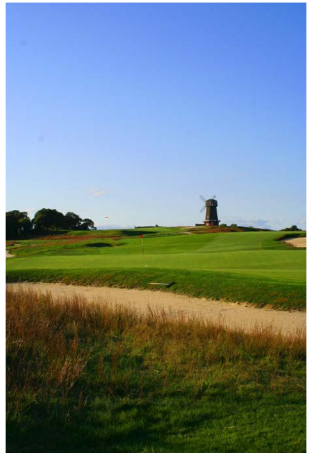
National Golf Links of America and the famous windmill off in the distance