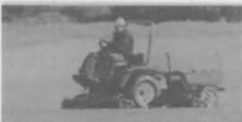
The 3365 Professional Turf Mower features John Deere designed and manufactured cutting units.

Deere 26-inch cutting units. The Gators are stable, quiet, carry large payloads, and feature wet-disk brakes.