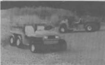
New 6x4 and 4x2 Gator Utility Vehicles are stable, quiet, and carry large payloads.