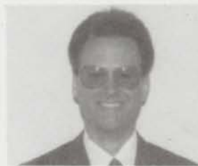
President Jeffrey Holmes

The environment is certainly a key component in our daily jobs and needs to be protected and preserved for future generations. We are stewards of today and tomorrow, and in order to do a good job protecting the environment, we need to be educated and also practice doing the right thing. The future of our environment is only as good as each of us.