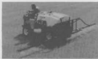
The 1800 Utility Vehicle brings benefits of hydrostatic drive to spraying & spreading jobs.

The 2653 features the unique combination of hydraulic reel drive and John