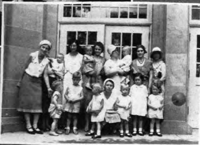
Left: Nothing wrong with this crop . . . all winners in Baby Show.