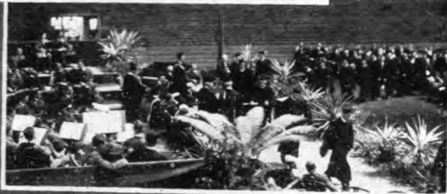
Below: That last line when seniors receive diplomas.