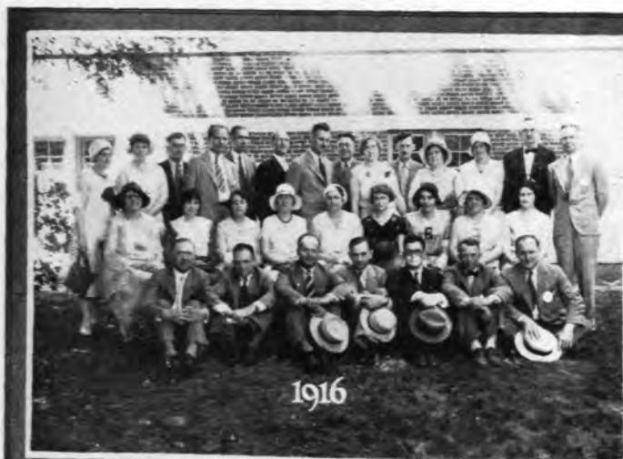
Below: Oh! what fun at the Sunset Supper.