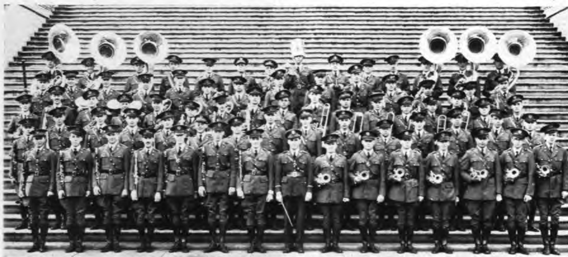
THE BAND ON THE STEPS OF THE CAPITOL, WASHINGTON, D. C.