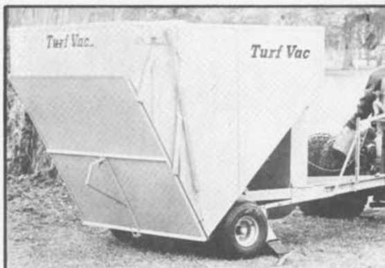
MODEL - FM5