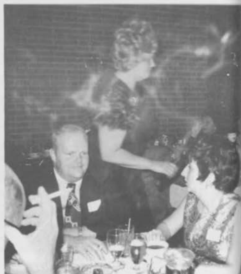
Bob and Jackie Hope sitting one out.