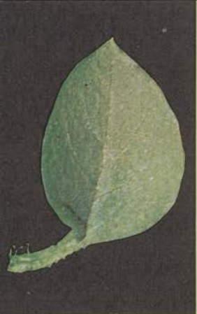
Smooth, shiny pointed leaf