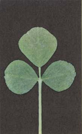
Middle leaflet on stem. Small yellow blossoms