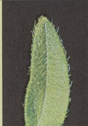
Hairy, elongated leaf

Chickweed — control with KANSEL (Hairy) or TURFBUILDER PLUS 2 or TURFBUILDER PLUS 4