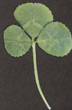
Leaflets joined at base. Large white blossoms

Clover — control with KANSEL or TURFBUILDER PLUS 2 or TURFBUILDER PLUS 4