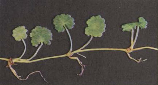
Scalloped leaves on creeping vine