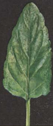
Triangular leaf, sparsely hairy on top side