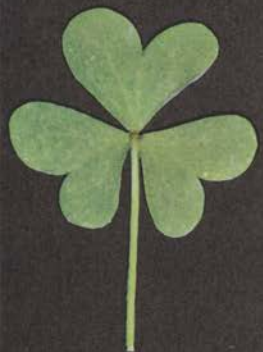
Heart shaped leaflets