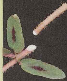
Dark spot in leaf. Stem exudes milky sap when broken