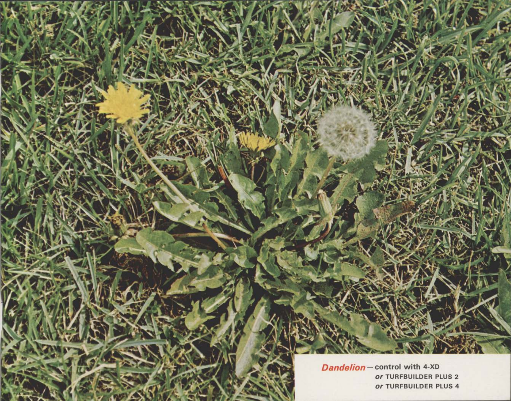
Dandelion — control with 4-XD or TURFBUILDER PLUS 2 or TURFBUILDER PLUS 4