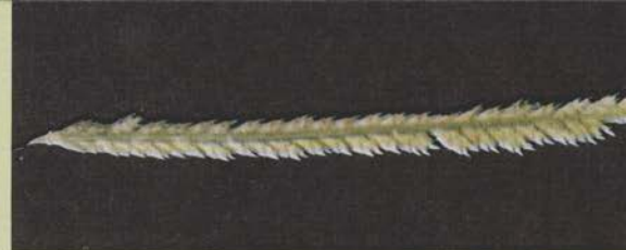
Seedhead looks like closed zipper