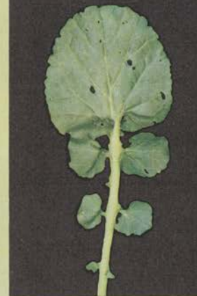
Large lobe at tip of leaf

Yellow Rocket — control with 4-XD or TURFBUILDER PLUS 2 or TURFBUILDER PLUS 4