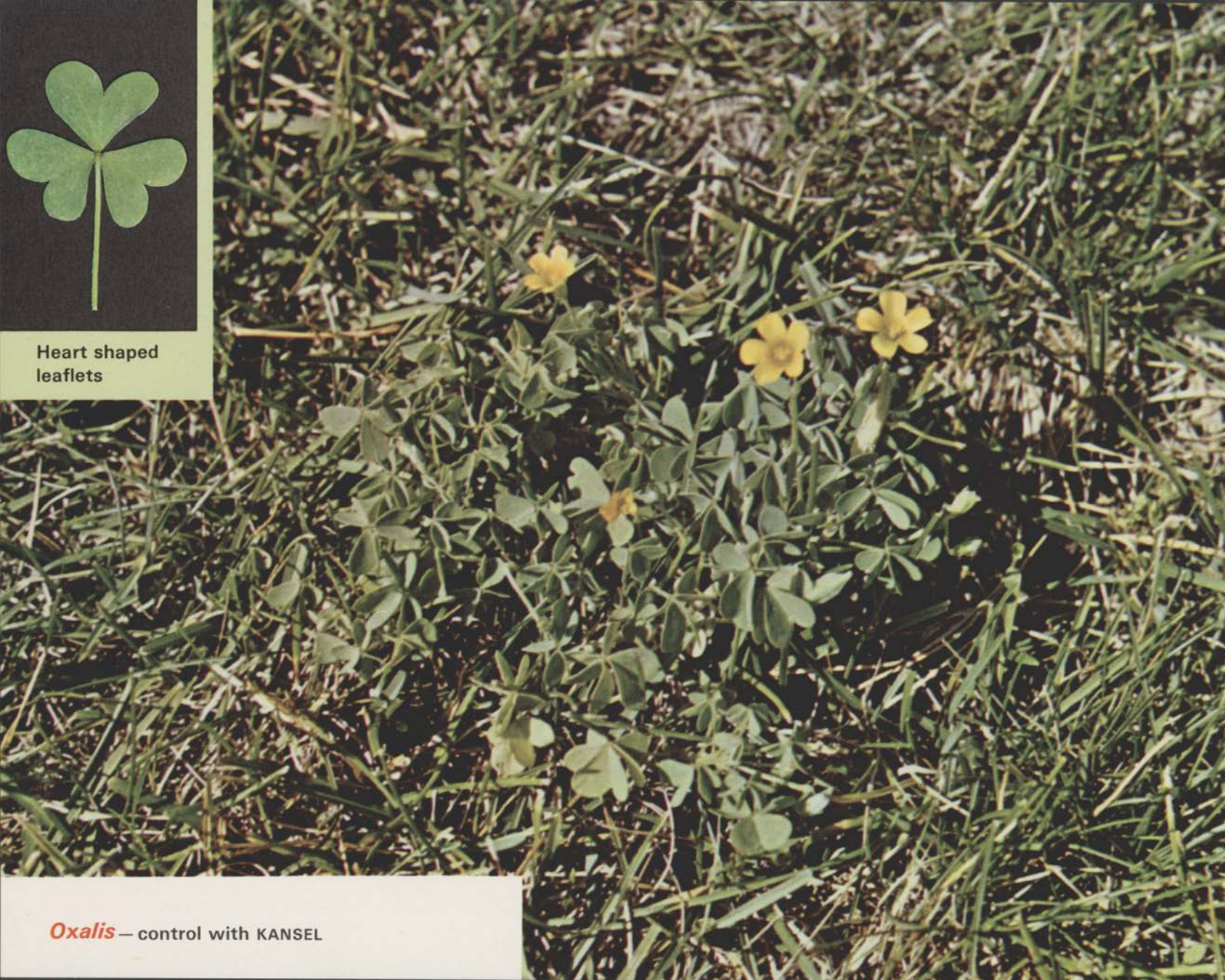
Oxalis — control with KANSEL