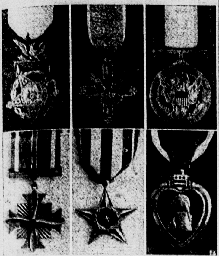
These are the most important medals awarded to United States servicemen. First row, left to right: Congressional Medal of Honor, Distinguished Service Cross and Distinguished Service Medal, all for the army; bottom: Distinguished Flying Cross, Silver Star and Purple Heart.