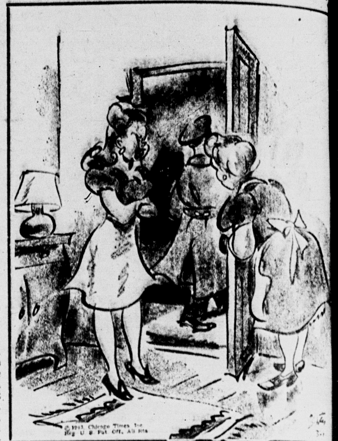
"The USO has certainly spoiled him—all he craves is lights, music, and professional entertainment—hasn't satisfied to sit in a dim parlor and hold hands, and stare."