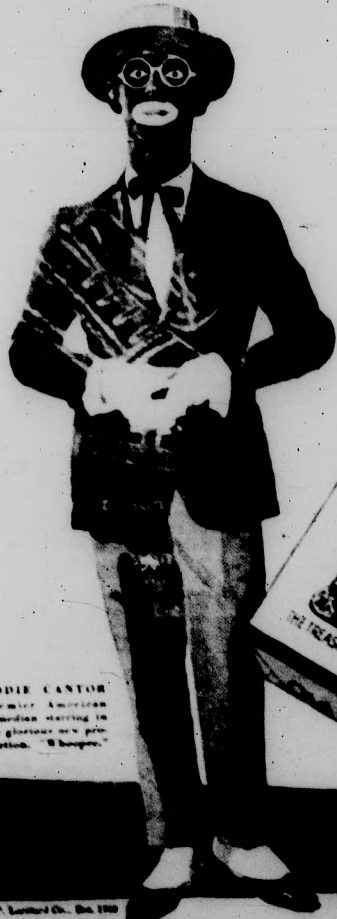
EDDIE CANTOR Premier American Comedian starring in the glorious new pro- duction, "Whoopie."

"Folks, how can I make Whoopee up here . . . when down in front the 'coughers' are whooping?"