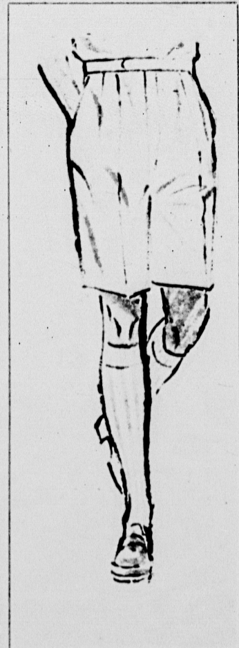
Polished Cotton Shorts are wrinkle resistant. Sanitized, mercerized washable. Ivy belted back style. In Tan. $3.98 sizes 30 to 38.