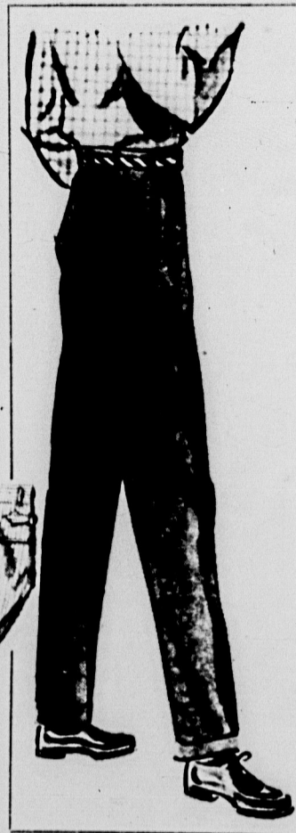
Polished Cotton Slacks, Ivy model with back strap. Completely washable. In Tan. $4.98 sizes 29 to 33.

Shade Striped pants of fine washable twill. Sanitized and mercerized. In Ivy League model. Sizes 29 to 36. $4.98