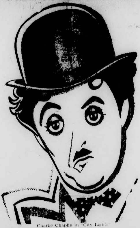
Charlie Chaplin in "City Lights"