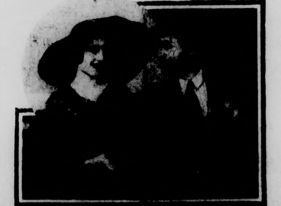
William Powell, Carole Lombard, and several feminine slaves in the Paramount Picture "Man of the World"