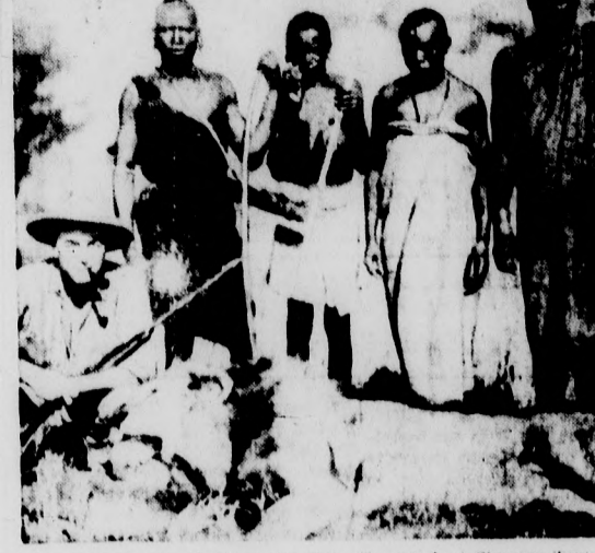
Scene from "Trader Horn" at the State Theater, Last Showing Tonight

Plan Programs For Retreat At Waldenwoods (Michigan Daily) Many Student Religious Groups to Send Delegates to Annual Convention.