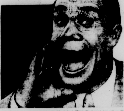
Joe E. Brown, as he appears in his latest First National hit, "You Said a Mouthful." Supporting him in this film are Ginger Rogers, Preston Foster, Sheila Terry and many other notables.