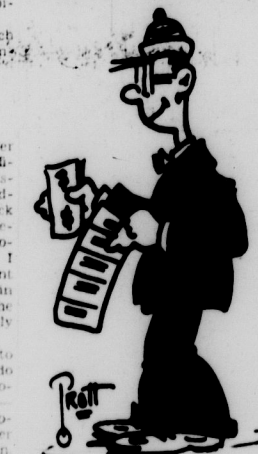
Is Lost in Maze of Classifications But Bravely Struggles On.