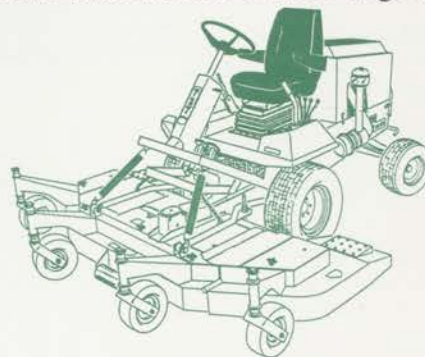
727 with 91in. Deck