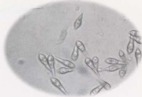
Conidia of Pyricularia grisea

Gray leaf spot is already active in the Southern states. Mid-July, he says, is the time to start paying attention to the weather and any reports coming from the South on the disease's northern migration.