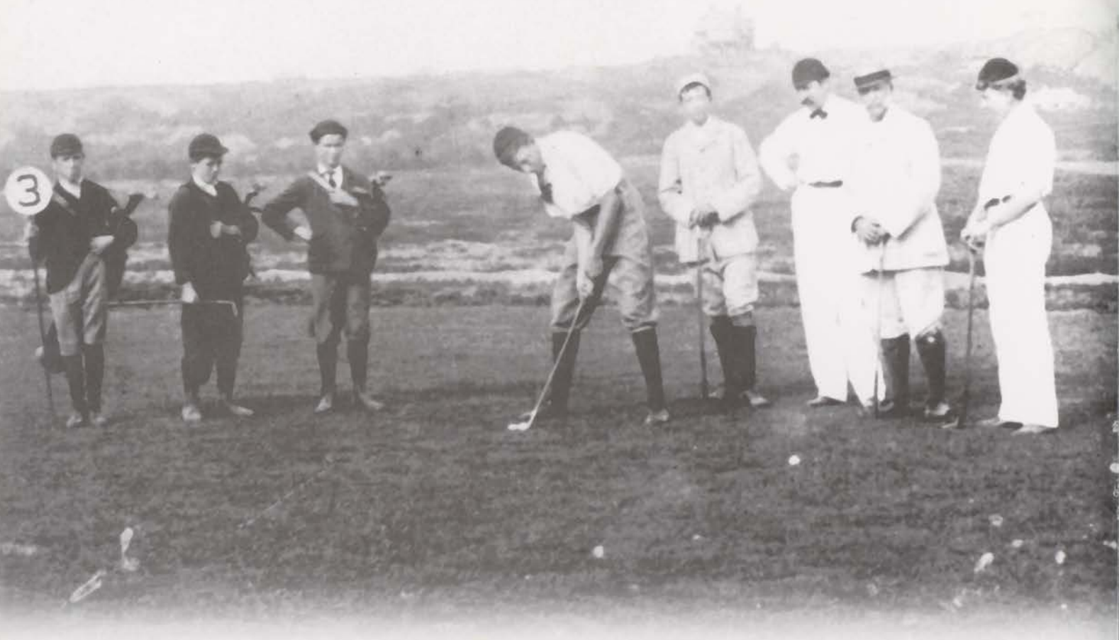
This was a putting green around the turn of the century. The surface was not even as good as today's fairways.