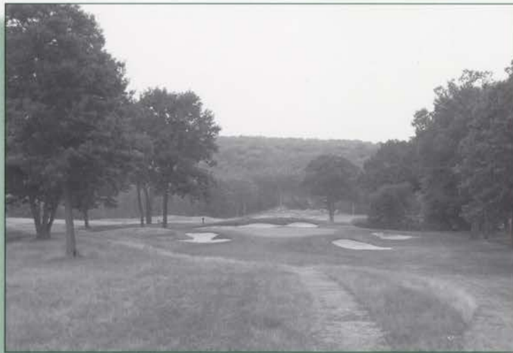
Cover: The Tuxedo Club.