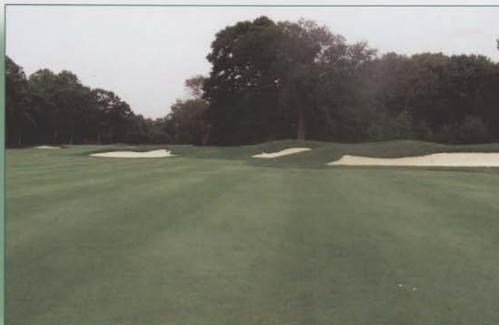
Cover: Wee Burn Country Club