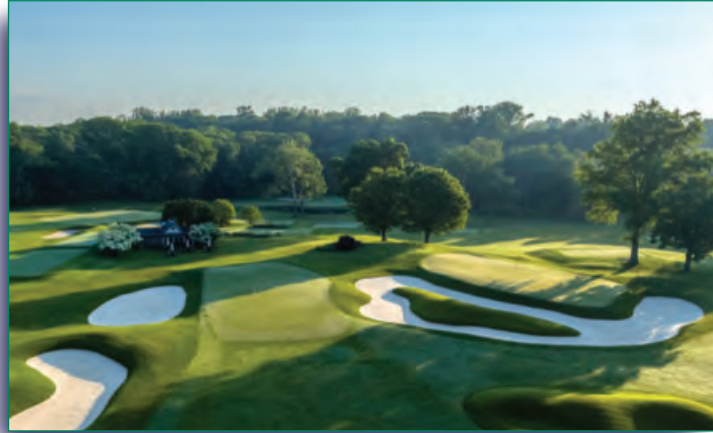
Cover: Fenway Golf Club