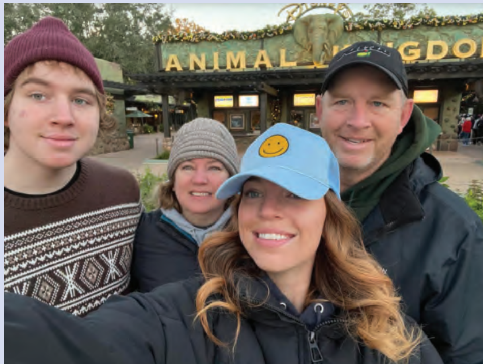
Family trip to visit Mickey!